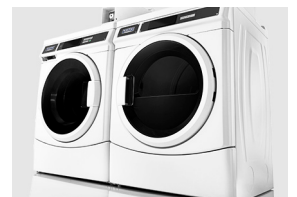
MATCHING WASHER AVAILABLE