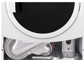
FRONT ACCESS PANEL