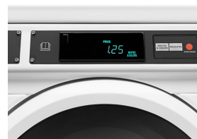
ONE-TOUCH CYCLE SELECTION